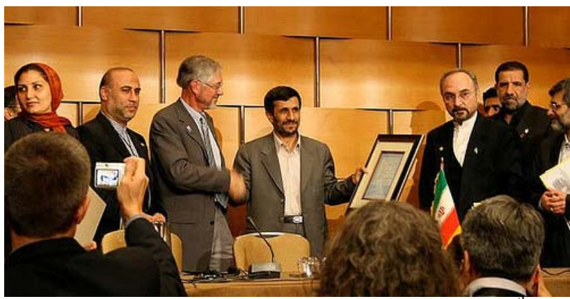
Ahmadinejad's meeting with US anti-war groups, Sep. 24<sup>th</sup>. 2008