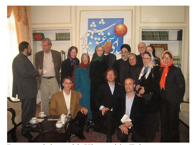
Peace activists with Khatami in Tehran